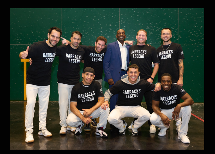
Jai Alai Miami -Magic City Fronton