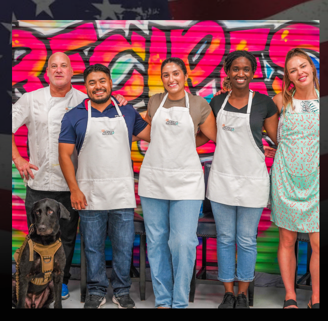
Cooking Class with Recipe For Success