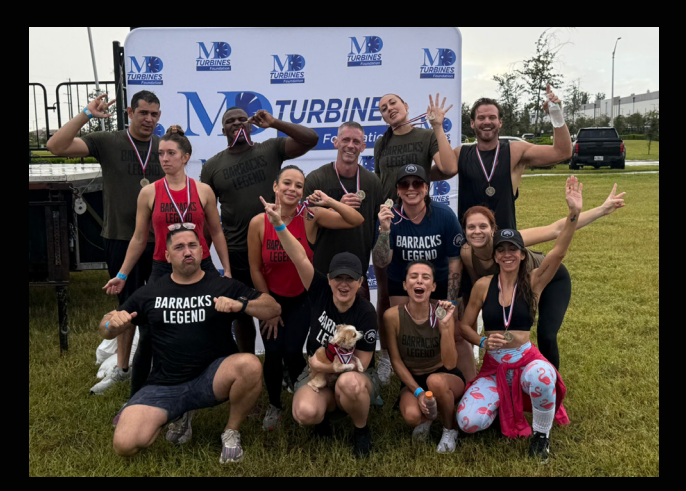
5th Annual MD Turbines Relay Challenge