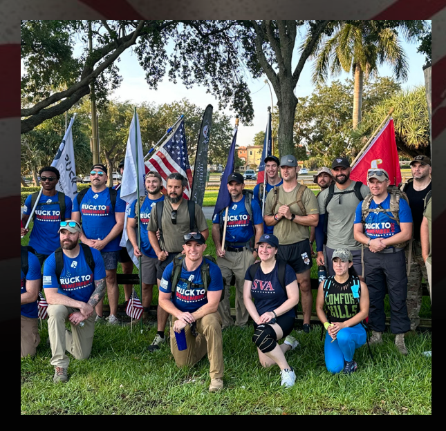
Memorial Day Ruck of Honor